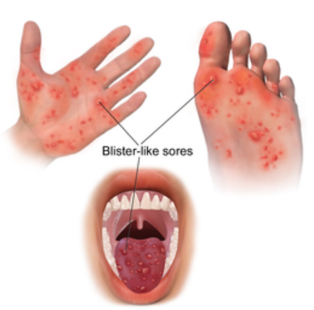
Hand, Foot, and Mouth Disease

It is caused by a virus and most often occurs from spring to fall. It spreads from person to person through contact with saliva coughs, sneezes, or contact with the feces (poop) of an infected person. A person with HFMD is most contagious (able to spread the disease to others) during the first week of illness. HFMD has no specific treatment and will go away by itself.